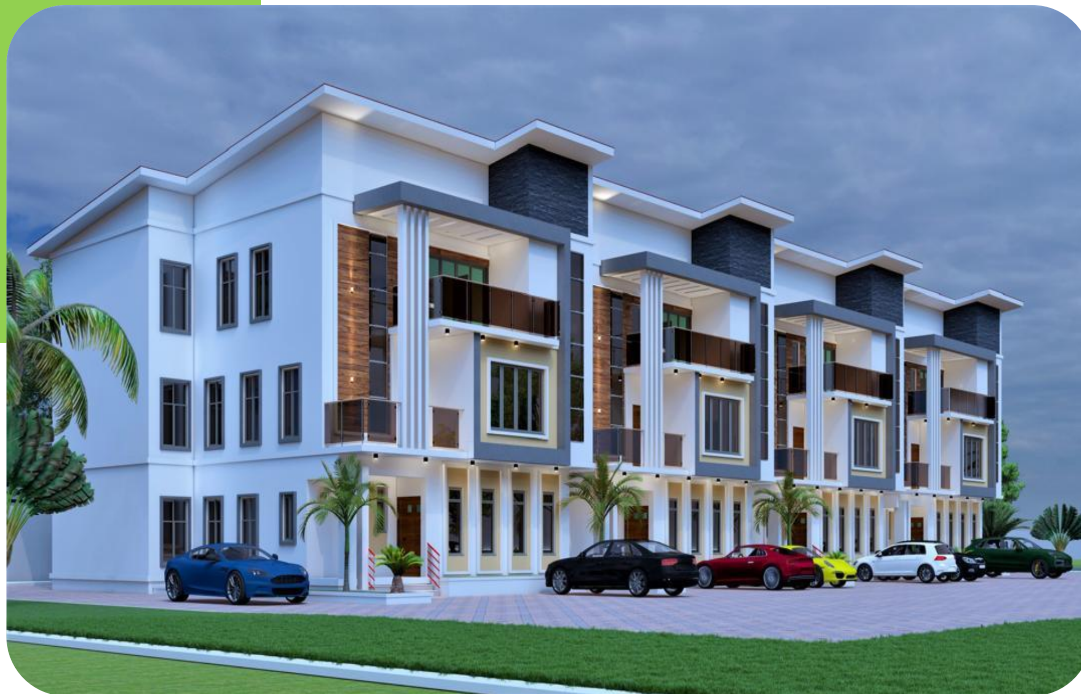
5-Bedroom terrace Duplex 1200sqm