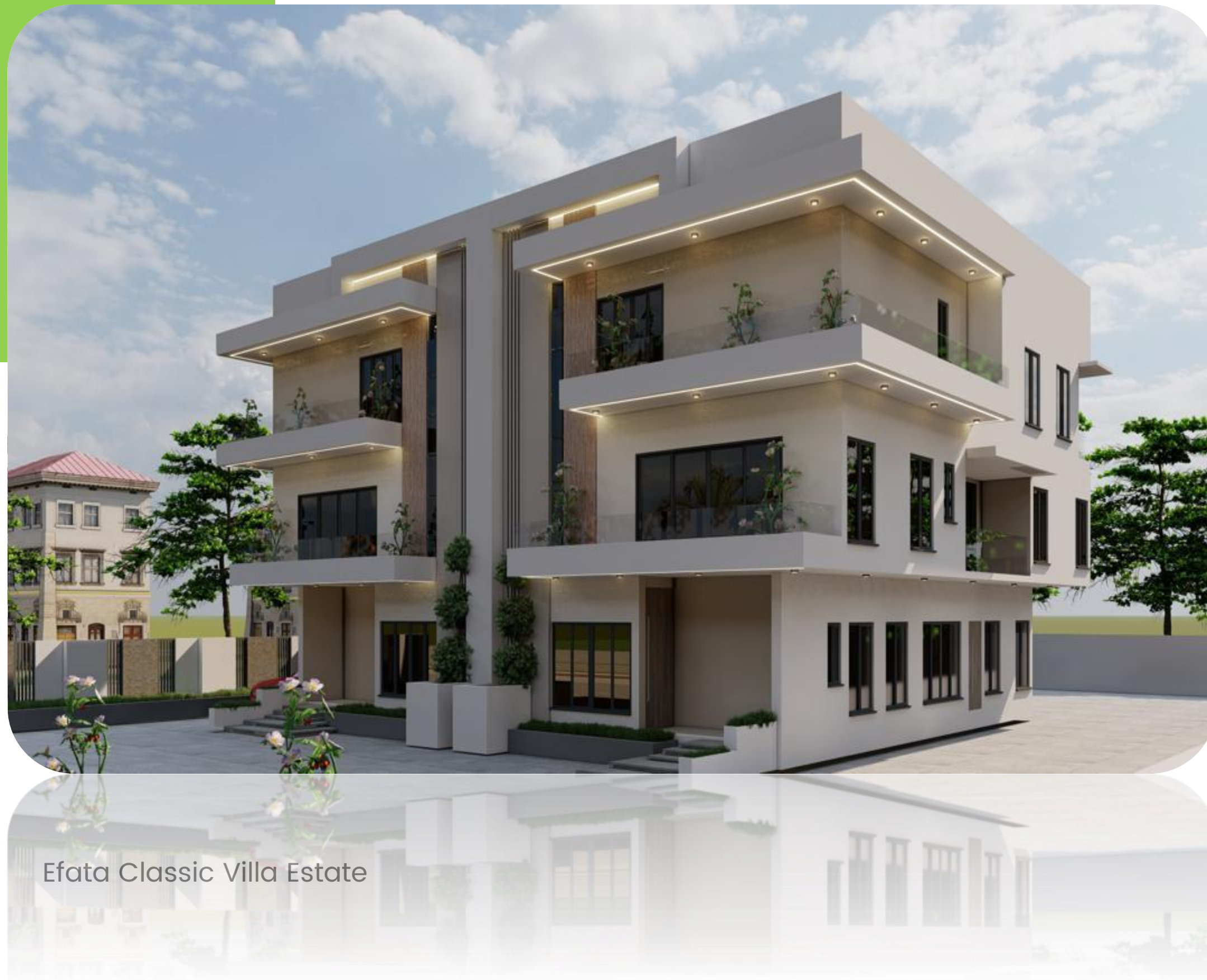
5-Bedroom Semi Detached Duplex 600sqm