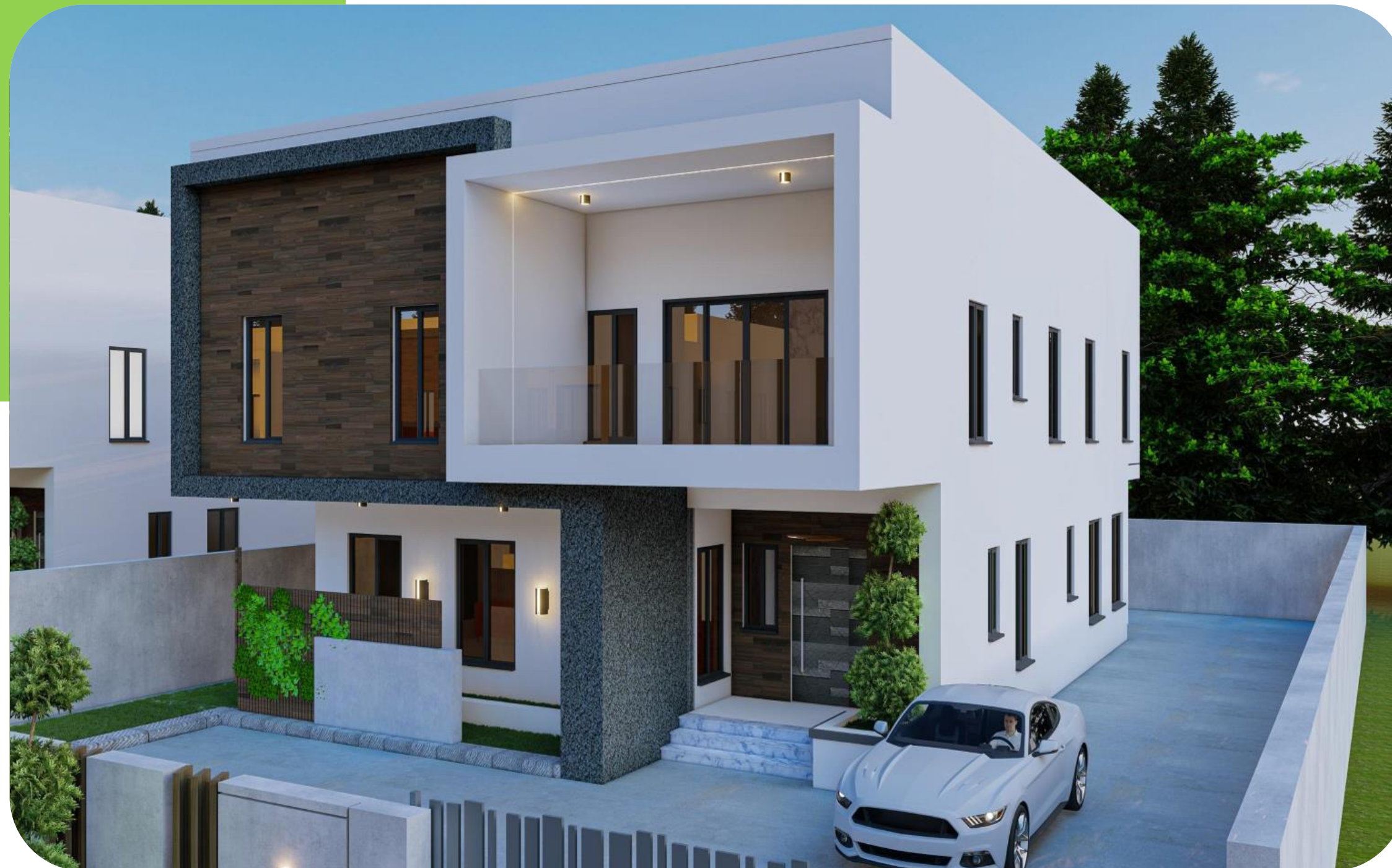
4-Bedroom Detached Duplex 400sqm